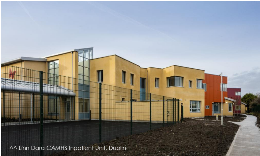
^^ Linn Dara CAMHS Inpatient Unit, Dublin

Linn Dara CAMHS inpatient unit installed the AQUA 3000 Open system to operate and manage a range of different outlets including; ensuite basins, WC's and showers across the facility's 24 bedrooms and ancillary rooms.